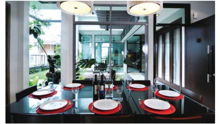
The living and the dining room exudes simple elegance yet allows ample working space. A great advantage of the glass curtain wall is that natural light is allowed to penetrate deeper within the building.